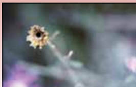
Fig. 16 Knapweed seedhead with emergence hole—Pennington County