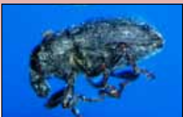
Fig. 15 Larinus minutus adult (flowerhead weevil)