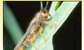
Fig. 5 Oberea erythrocephala adult on leafy spurge