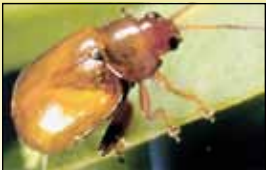
Fig. 1 Aphthona nigriscutis adult (brown flea beetle)