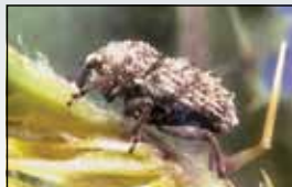
Fig. 13 Trichosivocalus horridus adult (musk thistle rosette weevil)