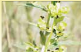
Fig. 3 Aphthona lacertosa flea beetles on leafy spurge