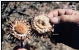
Fig. 12 Left: Normal (musk thistle seedhead); Right: infested musk thistle seedhead