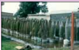
Fig. 18 Rearing buckets and tents for Galerucella Sp.