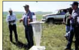
Fig. 4 South Dakota flea beetle collection/beetle sorter