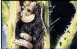
Fig. 7 Hadroplactus litura larvae in Canada thistle stem