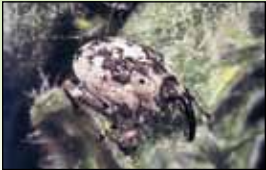
Fig. 6 Hadroplactus litura adult (Canada thistle stem mining weevil)