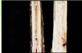
Fig. 8 Mined Canada thistle stem—Hand County