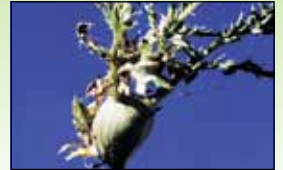
Fig. 10 Gall on Canada thistle stem—Beadle County