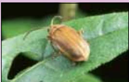
Fig. 17 Galerucella Sp. defoliating purple loosestrife