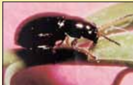
Fig. 2 Aphthona lacertosa adult (black flea beetle)