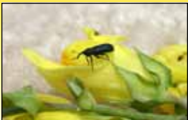
Fig. 14 Stem boring weevil Mecinus janthinus on Dalmation Toadflax