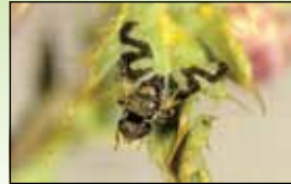
Fig. 9 Urophora cardui (Canada thistle gall fly)