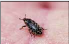
Fig. 11 Rhinocyllus conicus adult (musk thistle seed weevil)